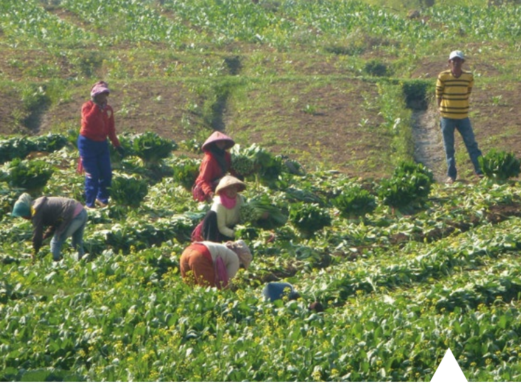
INDONESIA. A veterinarian from AGIRabcd in collaboration with a local NGO helped a group of farmers to make the most of their agricultural practices: when harvesting cauliflowers, the green leaves are reserved for animal feed.