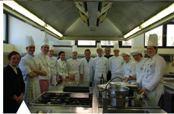
SLOVENIA. A master class in French cooking, taught in French by a volunteer French chef also promoted French language and culture in the context of the event "Maribor, European Cultural Capital". AGIRabcd is a partner of the International Organization of French Speakers.